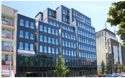
APARTMENTS & CONDOS