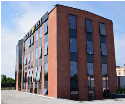
Amberline Europe Corporate Headquarters

Amberline Europe has strived to achieve the highest standards for manufacturing quality in all of our window and door systems.